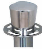
Urn Top CP40S